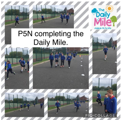
P5N completing the Daily Mile.